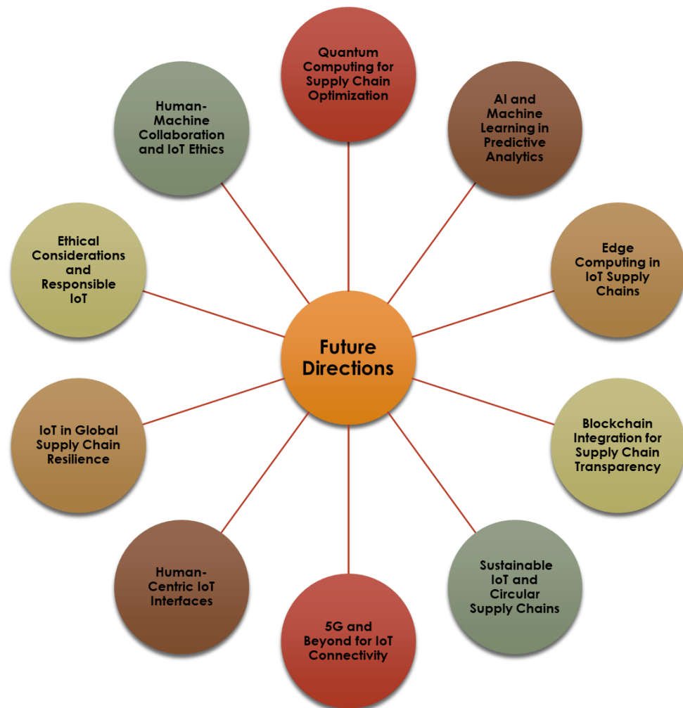
Figure 4. summary of main future research direction for IoT in SCM

research investigates the synergy between cloud and edge computing, exploring how hybrid 1 architectures can optimize data storage and processing in supply chain IoT ecosystems. 2 Understanding the trade-offs between centralization and decentralization in IoT architecture 3 will be crucial. Additionally, research in edge computing should emphasize the scalability of 4 edge solutions, ensuring they can accommodate growing numbers of IoT devices and data 5 sources while maintaining performance and efficiency. 6