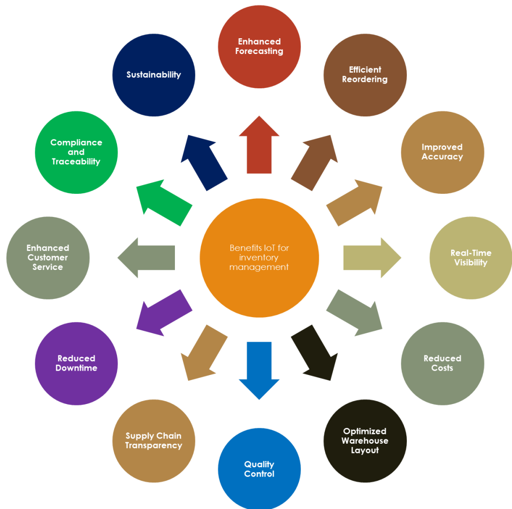
Figure 3. Visualizing the Benefits of IoT for Inventory Management

capabilities, enabling complex analytics, machine learning, and predictive modeling. The combination of edge and cloud processing ensures that IoT systems can derive valuable insights from the vast amount of data generated [9].